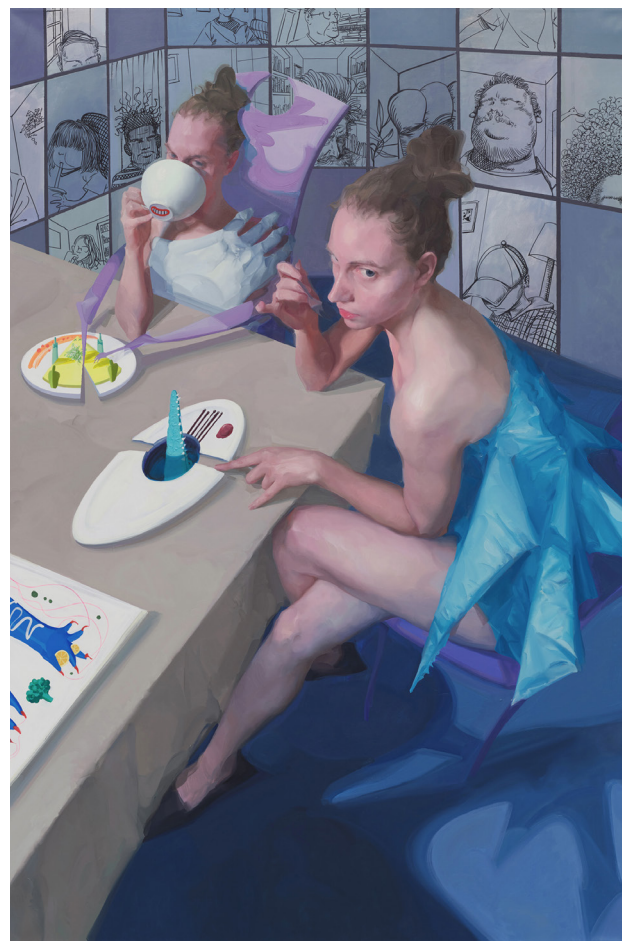
Figure 1. Shiqing Deng. ASMR . Oil on linen, 168×223cm, 2020.