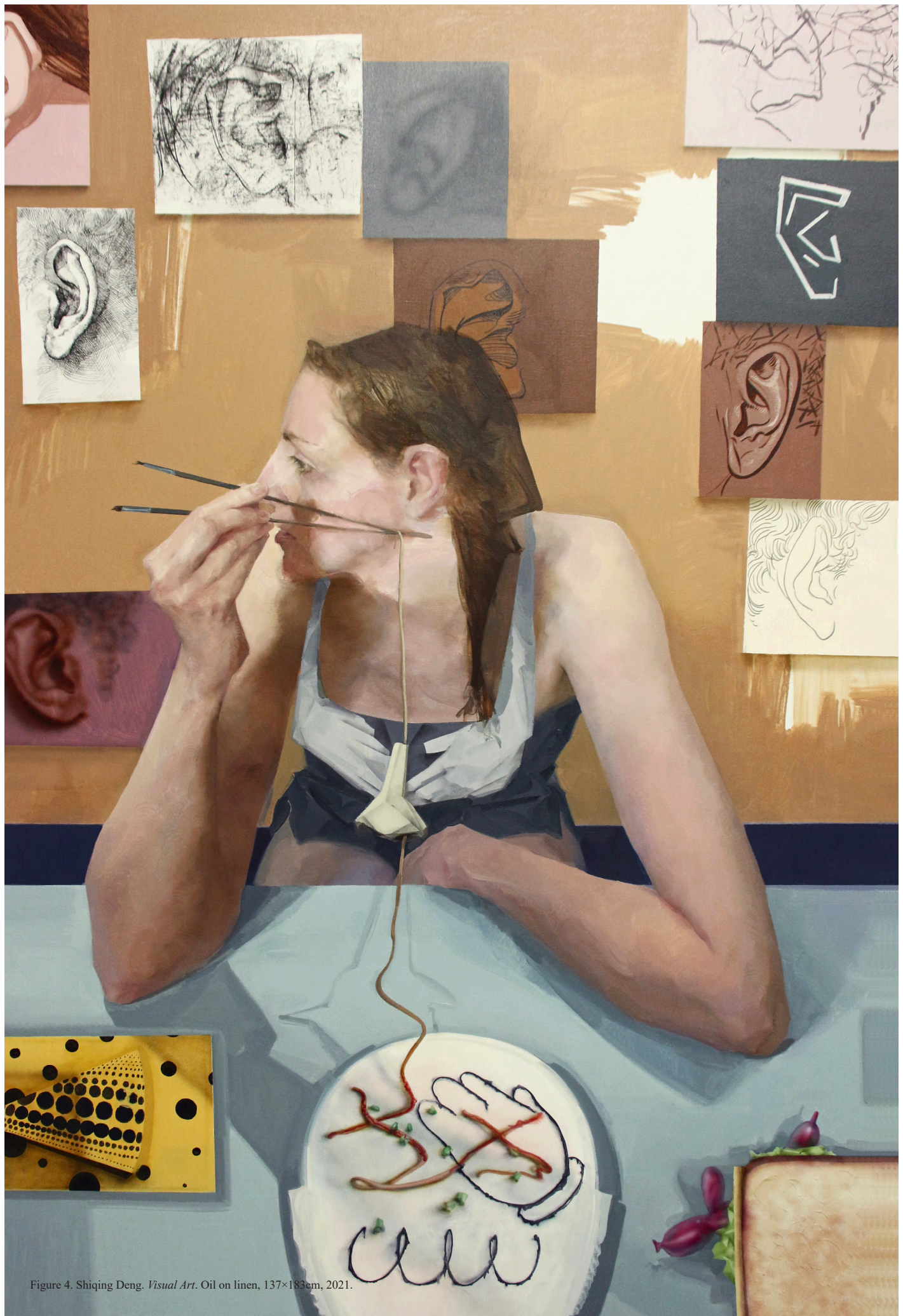
Figure 4. Shiqing Deng. Visual Art . Oil on linen, 137×183cm, 2021.