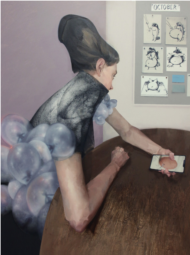
Figure 6. Shiqing Deng. Unexpected . Oil on linen, 117×147cm, 2022.

navigate more significant subjects, approaching them with greater acuity and freedom.