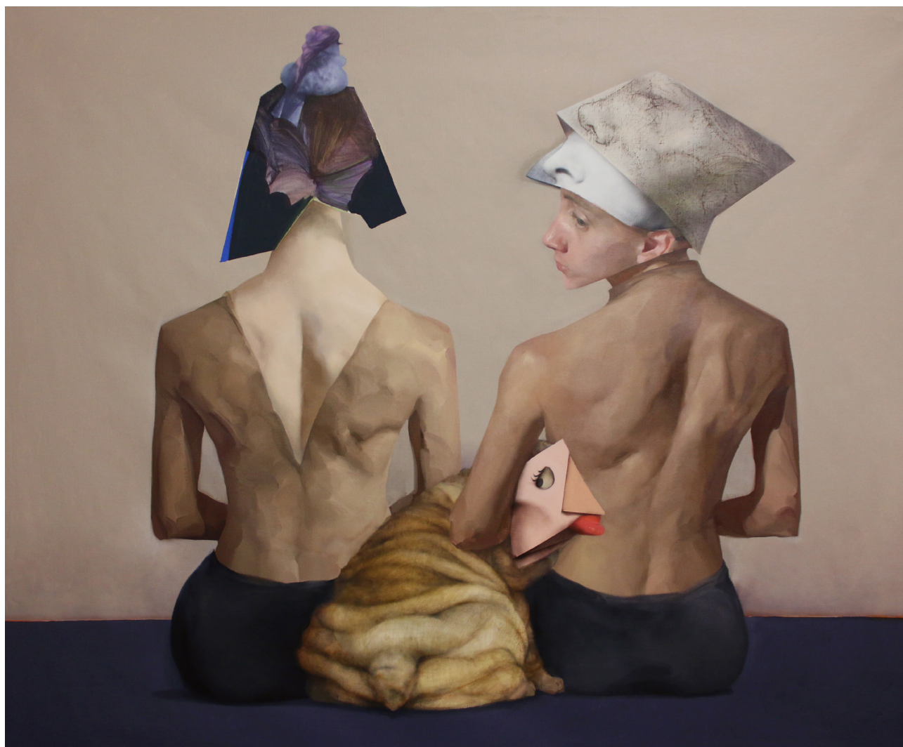
Figure 5. Shiqing Deng. Faces . Oil on linen, 142×173cm, 2022.

Shiqing Deng's figurative oil paintings exhibit extraordinary composition, harmony between reality and illusion, expansiveness, and contraction. The colors deserve commendation for their brightness, cleanliness, certainty, and well-balanced contrasts, which are elegant yet carry intrinsic strength. In her continuously emerging figurative artworks, her mastery of realistic techniques has reached a level of excellence. Moreover, her assimilation and integration of other contemporary artistic languages and styles enable Deng to skillfully